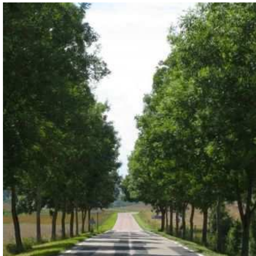
Figure 108: Tree-lined roads in France do not benefit from general protection. The result is clear: two départements , two different approaches. After the tree fellings of the 1990s a tree avenue which once lined the whole road now stops at the "border".

Is it enough to know that trees should not be cut down, and that we need to plant, manage, communicate, and promote road safety in order to ensure that this heritage survives? Can the future of tree-lined roads depend solely on the goodwill, cultural sensitivity and commitment of managers or elected officers whose career paths and mandates obey timescales very different to the lifespan of these trees themselves? Should this future be dictated, ad-hoc, by changing pressures and requirements even though we know that a tree cannot be "rebuilt" – unlike buildings, which may at times have been saved from disappearing altogether in this way?