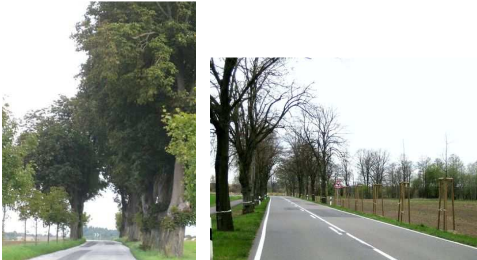
Figures 92, 93, 94 and 95: The practice of gap-filling is systematic in towns and cities and in parks, where significant effort is expended to maintain a high-quality environment. The variation in size becomes less obvious over time and is less stark in appearance than an avenue punctuated by ever larger gaps. Three examples of gap-filling roadside plantations: North-Brabant, Scania and Brandenburg.