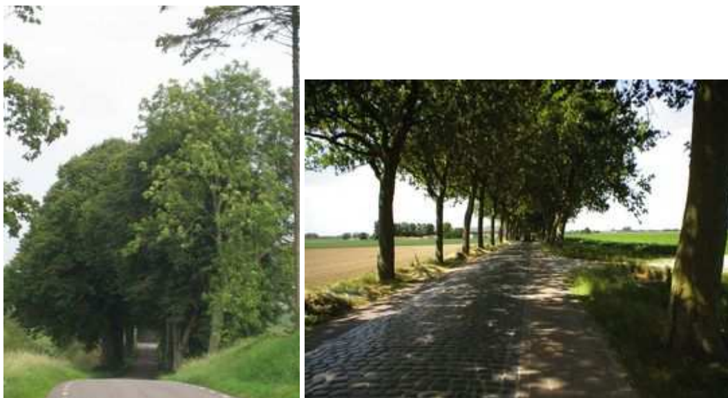
Figure 85: Many country roads can cope with moderate levels of traffic, with features which are already sufficient for the purpose, as here in Sweden. Figure 86: This photograph from the Dutch CROW guide no. 259 " Plattelandswegen mooi en veilig " (roads in the open countryside: beautiful and safe) shows that sustaining trees and historic road surfaces is compatible with contemporary government and a policy of "Sustainable Safety". The use of different coloured paving stones creates the illusion that this is a single traffic lane, making users more vigilant and careful.

Road infrastructures are evolving and our towns and cities are changing: traffic levels are increasing, soft modes of transport like the bicycle are becoming more popular, as are light rail systems. Yet this in no way conflicts with the aim of sustaining tree-lined roads in the urban environment or in the countryside. The first question to be asked, as a Prussian edict dating from far back as 1841 points out, is whether new developments are really necessary: only a small number of routes generally carry large volumes of traffic, so is it necessary to incur significant expense to widen or straighten roads serving local traffic needs? Would it not be better to educate drivers on road sharing issues, which will improve safety for all road users everywhere?