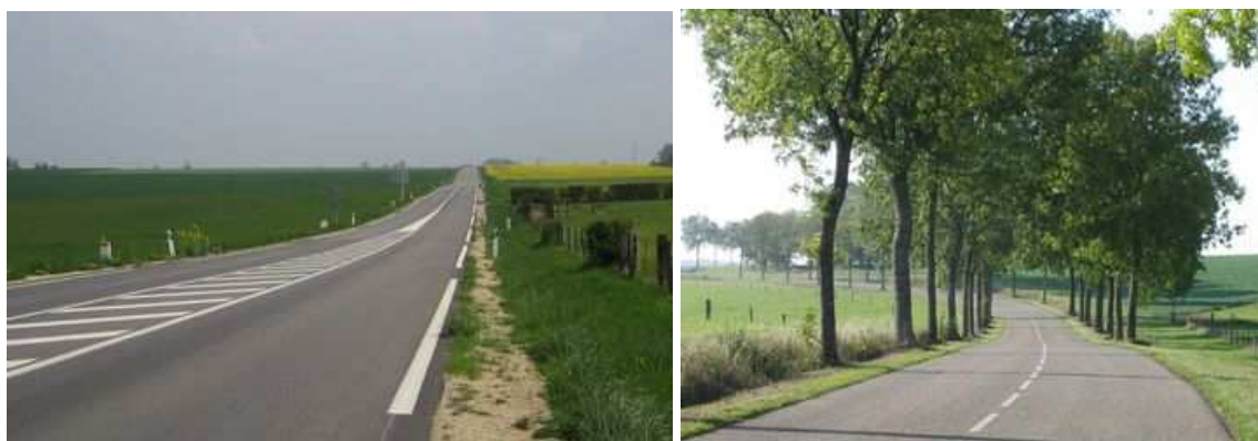
Figures 74 and 75: Two philosophies of travel – one mechanistic, the other hedonist.

Tourism also benefits. At the far end of the spectrum from “Vision Zero”-style roads where drivers are interested in nothing except arriving at their destination and getting there within a particular time, with no room for any emotional response, tree-lined roads extend an invitation to explore and discover the countryside they cross: in this respect they enhance the area's attractiveness.