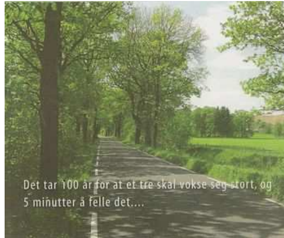
Figure 84: This brochure from Norway's roads department reminds us that it takes 100 years to make a tree but just five minutes to cut it down.