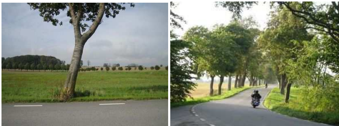
Figure 41: In the background, to the left, a very regular avenue of lime trees leads to an estate; on the right a recent and much less homogeneous plantation borders a public road (in Sweden). Figure 42: Limes, elms, chestnuts, ash trees and Norway maples line either side of this road in south-western Sweden

Local usage has also traditionally been a deciding factor in the choice of species: in the vine-growing region of Burgundy, 18 th -century roads were lined with elms and whitebeams used for the presses; elsewhere, mulberries were planted for silk farming. Meanwhile poplar planting expanded significantly in the 19 th century because the tree's rapid growth made it popular for domestic and industrial purposes.