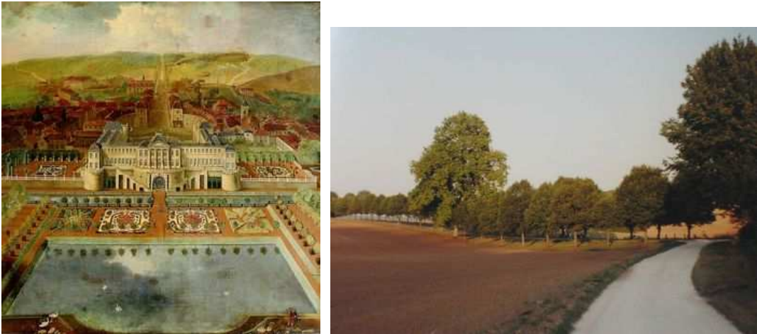
Figures 117 and 118: In the background we see the avenue of lime trees which extends over more than 2km in view of the Château de Commercy (France). It was planted around 1721 or 1750 and has been protected as an outstanding site since 1911. The ensemble, now partly located in an urban area, comprises nearly 500 trees, some of them more than a century old, and is regularly restored.

Regulatory protection varies greatly from country to country. Some countries (France, Luxembourg, Latvia and Belgium, for example) protect double-row avenues, for example, if they are considered to be outstanding. This type of protection is based on classification, carried out on a voluntary basis or even with the landowners' agreement, with the result that the number of avenues protected varies and is limited overall (around 60 in Latvia, for example – but nearly 900 in just the Wallonia region of Belgium, which is one quarter the size).