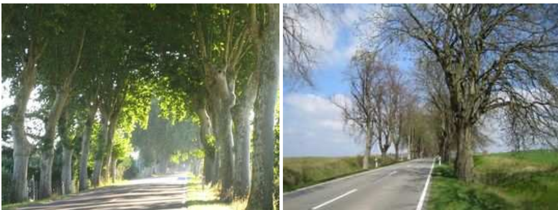
Figures 37 and 38: Matching rows of planes in southern France and chestnut trees in Mecklenburg

Regional variations can be seen above all in the choice of species, which varies according to geography, climate and soil type as well as reflecting changing fashions. The choice also varies