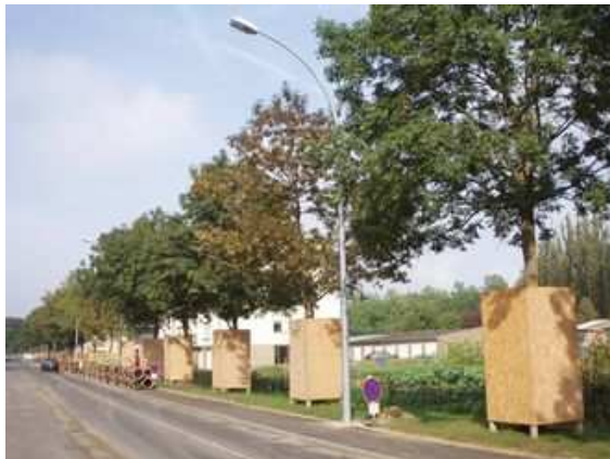
Figures 103 and 104: In Luxembourg, posters are regularly supplied to companies and distributed on building sites. Specialist forestry officers act as consultants in the planning of road works.

In order to ensure that the efforts devoted to tree planting and maintenance are not wasted, it is vital to ensure that the tree is protected from all sources of potentially fatal damage. Cleaning tools after working on one tree before moving on to the next is basic plant health good practice to help prevent the spread of disease. Rules to be observed during works programmes must be contractually specified, whether this takes the form of standards or technical manuals as in Germany, or charters as in some towns and regions in France. These must be combined with financial penalties for non-compliance, the level of the penalties reflecting the asset value involved.