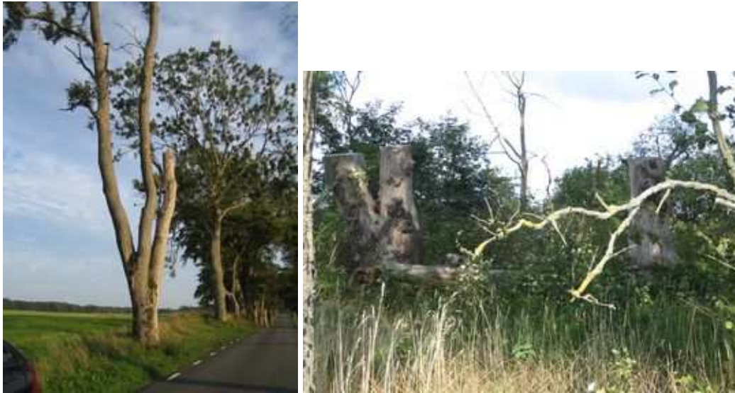
Figures 82 and 83: In Sweden, where tree-lined roads are protected as biotopes, the trees are retained in situ , taking care to ensure their stability, or else they are cut and driven into the ground close to younger trees or on nearby surplus land, as here.

The most urgent priority is to stop tree felling and to retain existing trees for their own sake, without reference to timber production policies: our current timber supply needs are already largely covered by existing forests. Moreover the trees' function as a unique biotope makes it important to retain trees of all ages, and ancient trees in particular. These can be regenerated through appropriate treatment (pruning). They must be kept within their rows as long as the overall aesthetic impact is not affected, while ensuring that there is no risk of trees falling onto the road.