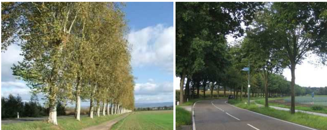
Figures 89 and 90: Tracks running alongside the road, sheltered by the trees, can be used by cyclists or agricultural machinery.

Transplantation is another option, providing this does not open the door to ill-considered projects which treat trees as objects that can be moved about at will. Making use of modern resources, this technique can be completely successful for some species and for trees with diameters of 40 to 50cm – or even as much as 100cm. Success depends on careful preparation and meticulous aftercare (watering in particular). The costs are much lower than the asset value of the trees, which would be negated altogether if the trees were felled.