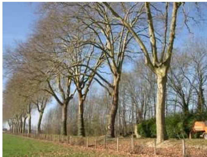
Figure 114: Gentle pruning undertaken by professional climbing arborists has two qualities: it preserves the tree's vitality and it is unobtrusive. It is a good idea to stage consciousness-raising tours for specifiers to ensure that this unobtrusiveness does not lead them to think they have spent money on "nothing".

Finally, raising public awareness is a key priority for the European Landscape Convention. This is a crucial issue for any landscape policy and consciousness-raising initiatives can take on an almost limitless array of forms. Germany and Sweden provide us with many examples.