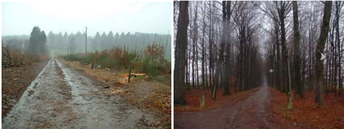
Figure 109: Near Neufchâteau in Belgium, a 750m double row comprising 247 beech trees with a heritage value of €2 million was cut down without authorisation. The case will be going to court.

Finally, flouting the regulations must result in sanctions, in the form of fines heavy enough to act as a deterrent, particularly in urban environments where major property development schemes are involved. These should be supplemented by compensatory measures, which should also apply in cases of dispensation. They should be sufficient to compensate for the losses incurred and must therefore be based on the asset value of the tree rows.