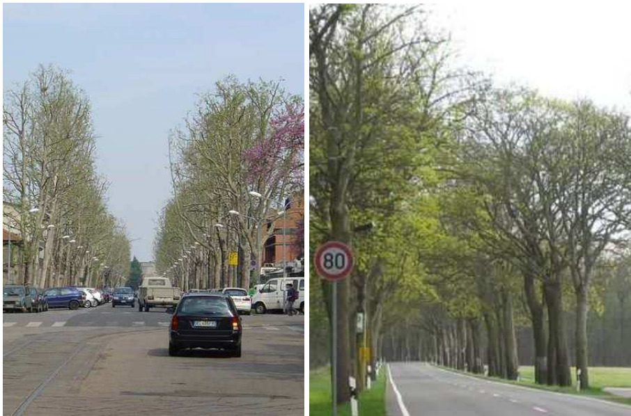
Figure 76: An avenue of plane trees in Milan. Figure 77: The Deutsche Alleenstraße running through Brandenburg.

Trees of any sort have a positive impact on household consumption: research has demonstrated that holiday homes located in surroundings crisscrossed by trees have occupation rates 30% higher than those in open countryside, while household expenditure is 11% higher in shopping centres with trees.