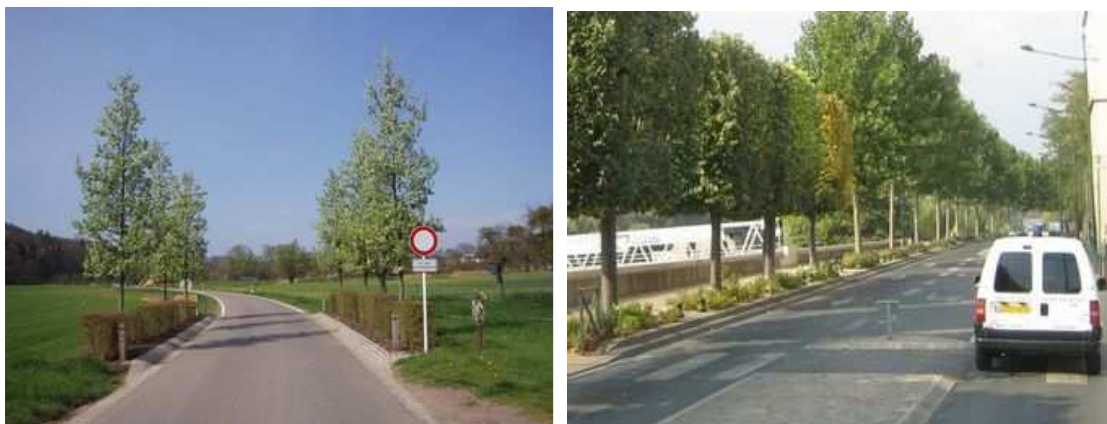
Figure 62: A double row of trees set in a low clipped hedge signals the approach to a built-up area in Luxembourg. Figure 63: Alongside the Seine, near Paris, a sequence of clipped lime trees takes the place of free-growing plane trees. The change visually signals an intersection, is aesthetic, and also acts as a safety barrier to stop disease spreading in the event of an outbreak of canker stain.

In 1916, the British writer R. Farrer described the approach to the battlefield of the Somme, to the north of Paris: "Along the voluminous velvety roads one rolls under plummy avenues of trees. And then the road becomes less velvety, and the avenues by degrees less plummy, till at once they are only stark skeletons, gap-toothed and shell-shattered in their rows" (Gough, 1998).