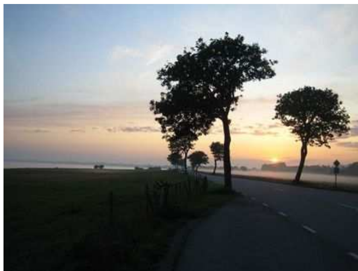
Figure 32: Remnant of rows of Swedish whitebeams along a coast road in Scania (Sweden).

In these three cases replantings have been either non-existent or nowhere near sufficient to make up for the losses. Will we have to echo the 19 th -century engineers of France's École Nationale des Ponts et Chaussées (national school of civil engineering) who observed that there were "great stretches without any trees" and predicted that "soon we won't see any trees at all along our roads" (Rafféau, 1986)?