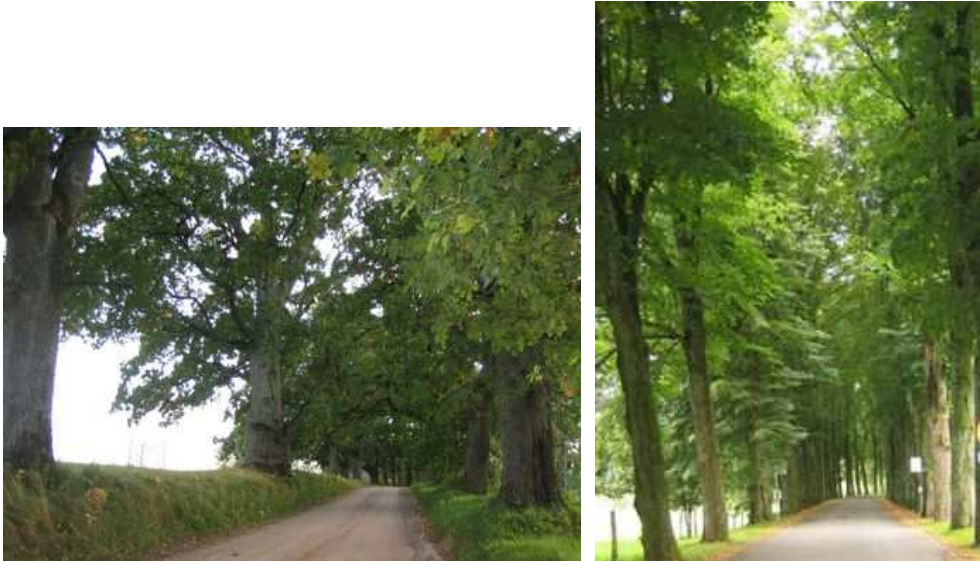
Figures 119 and 120: Two tree-lined roads which have been designated as outstanding and protected, one in Latvia, the other in Belgium.

Protection can also be limited to a given area, as with the "Alpilles" directive in France.