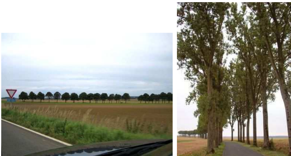
Figures 70 and 71: The intersection and the bend in the road are clearly visible from afar.

Rows of trees along a road contribute to safety by signalling bends, crossroads and the approach to built-up areas more effectively than road signs. They make it easier for drivers to read the road ahead, a key factor in helping them anticipate and adapt their driving to their environment, both in normal weather and even more so in snow or fog, or at night.