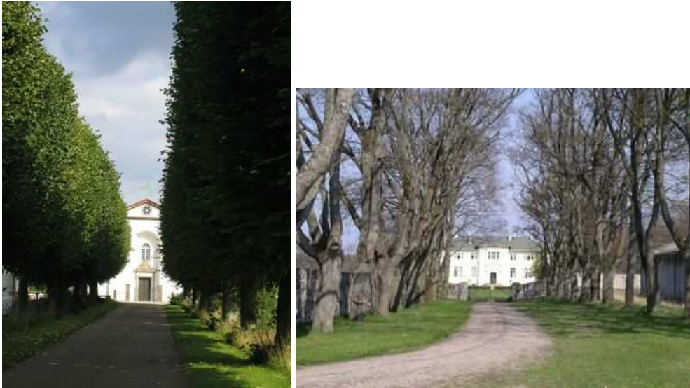
Figure 2: One of the many avenues in the grounds of Övedskloster Castle leads towards the church. The clipped style of pruning, which is rare in Sweden, retains the view of the church, accentuating the formal qualities of the design. Figure 3: Avenue leading to the castle at Gasiorowo, in the Polish county of Olsztyn.

Between 1596 and 1605, the Duke of Croÿ planted tree avenues leading to the castle at Heverlee, now in Belgian Flanders, and also around the fields of the estate. In 1647, Friedrich Wilhelm of Brandenburg planted six rows of lime trees leading from his residence over a distance of 1 km – creating Berlin’s famous boulevard Unter den Linden. In 1667, garden designer André Le Nôtre created the Avenue des Tuileries, which started at the Château du Louvre in Paris and opened onto countryside, with two rows of elms framed by two rows of plane trees extending over nearly 2 km.