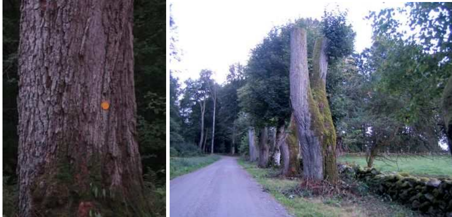
Figures 121 and 122: The yellow mark on a tree in Sweden means that it is especially valuable in terms of biodiversity. Here the trunks have been kept in place but they could have been moved to a nearby location as is done in some cases.

Other countries protect their tree-lined roads in a more general way. This is the case with Sweden, for example, which protects tree-lined roads for their biotope status in its Environmental Code. In Belgium, Wallonia not only protects specific outstanding avenues but protects all tree lines under its development, urban planning and heritage law. In Germany, protection for tree-lined roads as elements of the cultural landscape is enshrined in Federal law on protection of nature and the landscape. The federal states of Brandenburg, Mecklenburg, Schleswig-Holstein and Nordrhein-Westfalen have implemented similar government legislation.