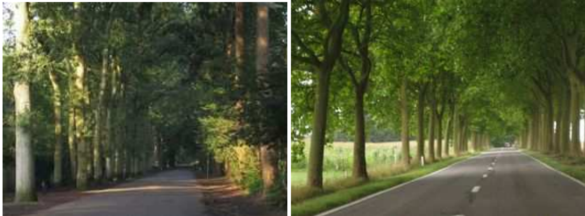
Figures 35 and 36: In the Netherlands roads lined with two rows of trees on either side are common; by contrast this road in Belgium has a single row of plane trees on either side

Some “very beautiful staggered rows of beeches” are mentioned near Bayeux in France in 1823 but this style of planting is rare, perhaps because – as Du Breuil mentions in his manual of arboriculture in 1860 – this form was thought to require extreme precision in planting in order to achieve a harmonious effect.