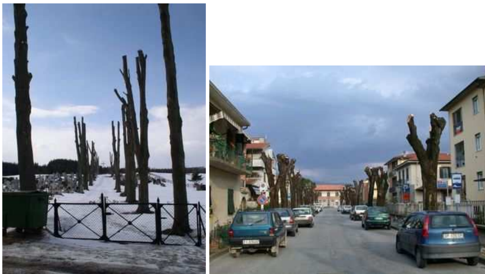
Figures 25 and 26: These examples are from Poland and Italy. Figure 25 shows another location where tree avenues were planted in the 19 th century: cemeteries

In 1802, D. Depradt, a member of France's Constituent Assembly, remarked: "There is nothing more pleasant and at the same time more impressive than a tree bearing all its branches, and there is nothing more unpleasant or perhaps more ridiculous than trees stripped of their branches; and yet the latter is the state in which they appear on some of the roads in France" (Depradt, 1802).