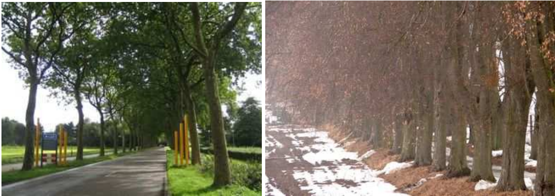
Figures 78 and 79: Both country roads and hidden byways deserve to retain the trees that adorn them (Netherlands and Poland)

In 2005, Denmark's roads department observed that "tree-lined roads constitute [...] an important element of our culture and our environment and merit special conservation as elements of our culture and landscape" – an opinion shared by the Swedish roads department.