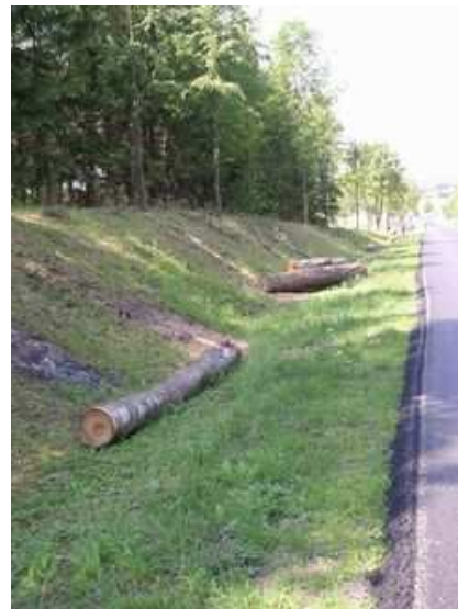
Figure 14: Road widening works on the outskirts of Riga. Figure 15: Tree felling in Masuria, Poland.

Alongside the increased number of cars on the road, improved vehicle performance, particularly in terms of speed, made road safety a serious problem for society as a whole. The number of deaths on the roads grew dramatically over an extended period culminating in the 1970s in Western Europe. Eastern Europe saw an even more spectacular rate of increase in the early 1990s. Road safety policies were widely adopted, and enhanced over time, with impressive results despite the fact that overall distances travelled were constantly increasing.