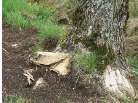
Figure 27: Example of damage caused by shoulder grading works.