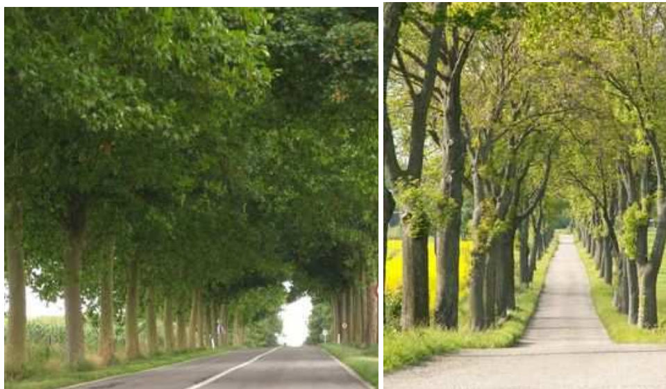
Figures 52 and 53: Tunnel or cathedral? Tree-lined roads in Belgium and Poland (Warmia-Masuria).