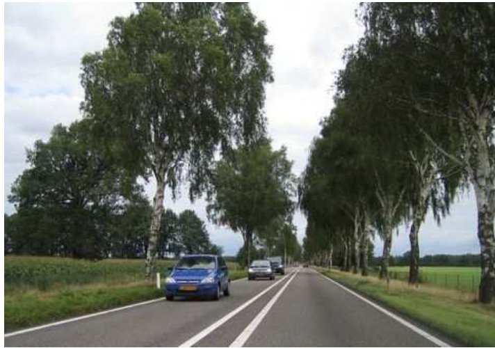
Figure 116: Roadside trees are not just for small country roads. This avenue is in the Netherlands.

planting and payments into a special fund for managing and renewing all the state's roadside trees, private as well as public. Schleswig-Holstein is already planning to follow this model.