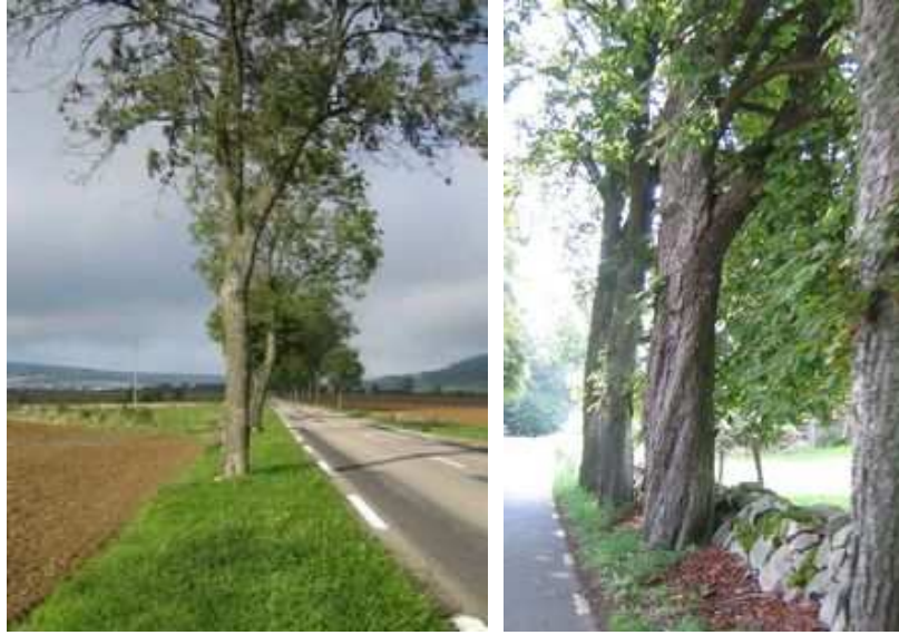
Figures 19 and 20: Planting at a greater distance from the roadway requires difficult land acquisitions. Examples from France and Sweden.