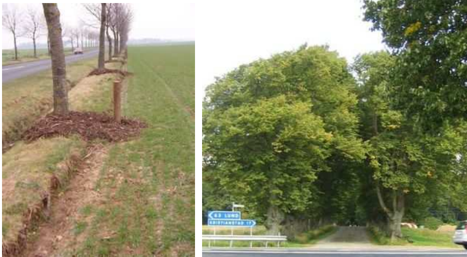
Figure 106: Posts used to protect trees from damage in France. If the trees had been planted on the verge, between the roadway and the ditch, the risk of impact damage would have been minimised while at the same time restricting root growth in the direction of the cultivated land. Figure 107: A strip of fallow land – here in Sweden – provides protection against impacts and soil compression.