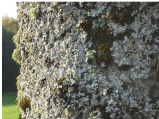
Figure 67: Along unsurfaced pathways and roads, such as can be seen in Sweden and Latvia, for example, the dust that is stirred up encourages the formation of lichens which are endangered elsewhere.

In urban environments where stone generally predominates over vegetation it goes without saying that tree-lined roads play a vital role for plant and animal life. Yet their role is also a crucial one outside towns and cities. The lighting conditions they provide, a subtle mix of light and shade that is different from a forest, make them unique biotopes, even in woodland regions. When the trees remain by the roadside beyond the level of forestry maturity, they can develop their role in the landscape to the full, reaching ages which make them irreplaceable. As a result they harbour many insects, providing unique hunting grounds for bats and birds and vital ecological corridors in open landscapes. Compared with roadside hedgerows they have the advantage of encouraging birds and bats to fly higher when their paths cross roads, which stops them colliding with vehicles.