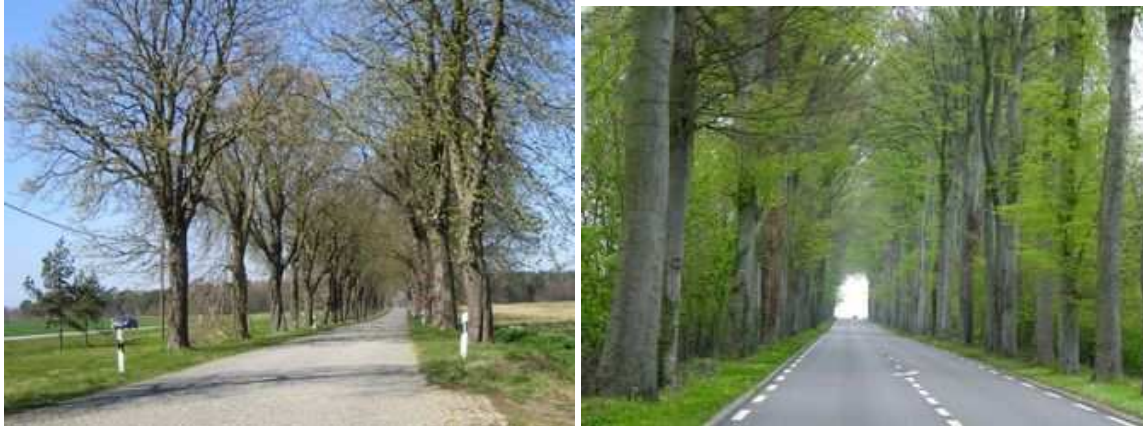
Figure 87: This historic road in Mecklenburg, retaining its original paving and its trees, is used for local traffic. Through traffic has been diverted onto a new road which runs parallel to the old one (on the left in the photo). Figure 88: On this Route Nationale (main road) in northern France, heavy goods vehicles travelling uphill use a parallel lane located beyond the avenue of tall beech trees.

When traffic levels and the road's function require it, one potential solution is to create a new parallel roadway and to divert onto it all or part of the road's traffic (either traffic flowing in one direction or a particular type of vehicle).