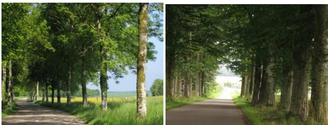
Figures 58 and 59: The landscape is revealed in a succession of images or at the end of the avenue (France and Belgium).

Tree-lined roads also give shape to the landscape, creating sometimes a rhythmic effect, sometimes a unity. Travellers along a road lined with trees see the landscape as a dynamic succession of images framed by the tree-trunks, which function as “windows” (another architectural term). The landscape is neither closed off (as it is by unbroken hedgerows) nor so wide open that the gaze gets lost in it: the space is framed and displayed to best effect.