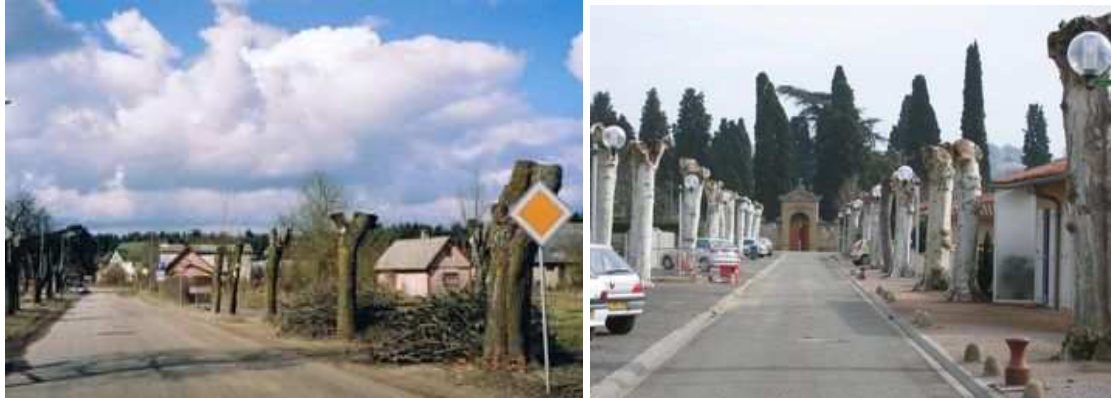
Figures 23 and 24: Technically incorrect, aesthetically offensive. These recent examples from Latvia and France are just a very small sample of practices which ought to be banned.