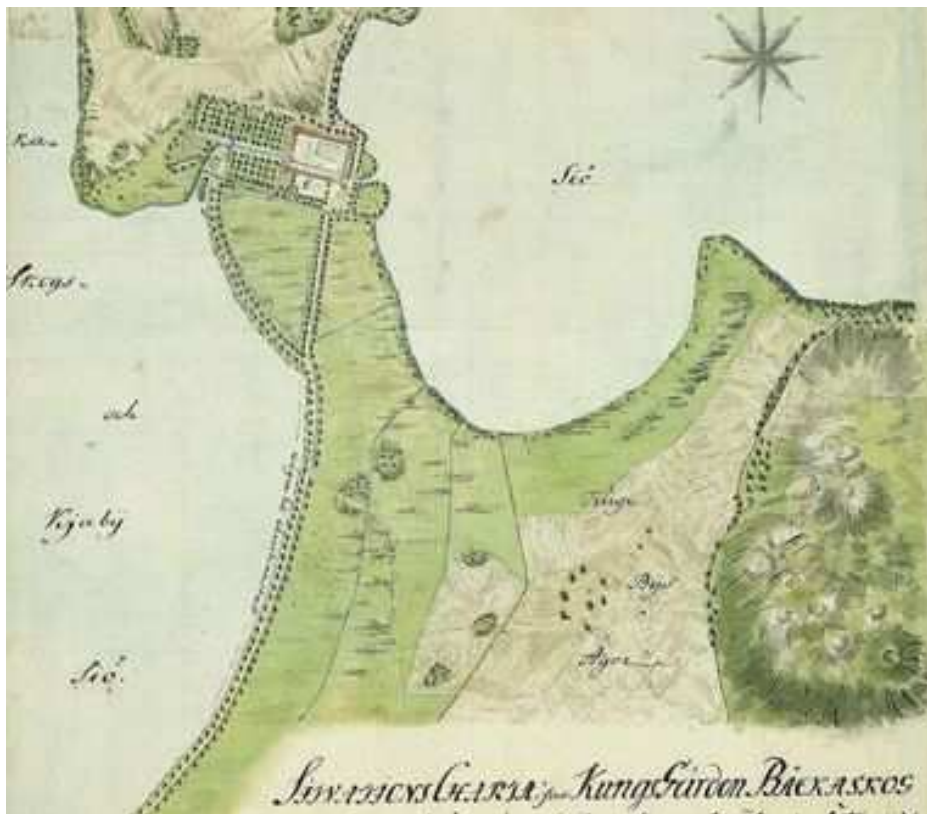
Figure 1: Map of Bäckaskog Castle (Sweden) dating from 1773, showing all the tree-lined roads around the castle

The rows of trees we can still see today along some of Europe's roads and streets have a long and rich history. The earliest features of this type date back nearly 500 years from the present day. In our view it is important to take account of this historical dimension – even though its treatment here is necessarily brief – because of the light it throws on the rich heritage that still survives in some regions of Europe.