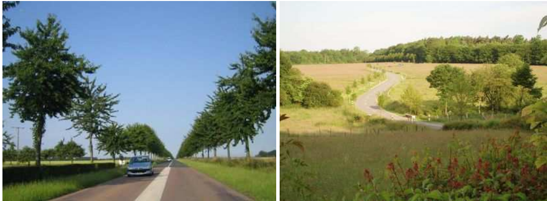
Figure 96: This double row of wild cherry trees in France is about 20 years old. Figure 97: Even though it is still young this new plantation in Luxembourg already creates a presence in the landscape.