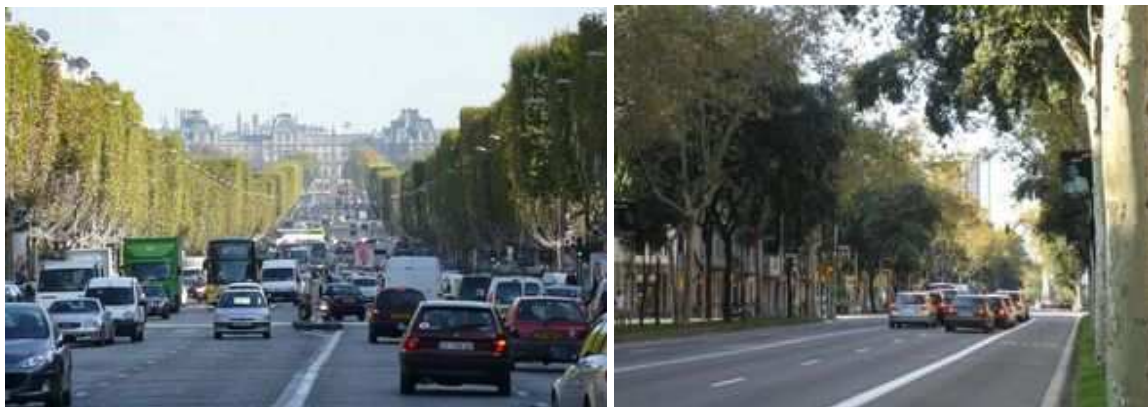
Figure 6: Just before Haussmann, from 1830 onwards prefect Rambuteau created the new Champs-Élysées avenue in Paris, lined with “English” style pavements planted with trees. Figure 7: Avinguda Diagonal in Barcelona, another avenue structured by rows of trees

Within towns and cities the appearance of tree-lined streets was driven by other changes. From the early 19 th century, following the earlier example of St Petersburg, cities in Scandinavia – Helsinki in 1817 and Vänersborg in Sweden in 1834, for example – began to create wide thoroughfares which were planted with trees, the aim in this case being to prevent and limit the destruction caused by fires. In Paris, prefect Haussmann embarked on a programme of grand avenues, which came to be known as “boulevards”, on a scale more ambitious than anywhere in Europe except Vienna. In 1856 this programme was underpinned by an edict specifying the number of rows of trees to be planted according to the width of the roadway.