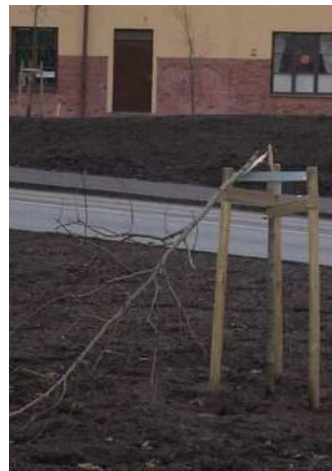
Figures 28 and 29: Examples of vandalism in France and Sweden. In the Netherlands, a car dealer infuriated by the tree in front of his showroom resorted to poisoning; in Luxembourg, nearly 1,000 trees have been vandalised since 1994.

Other attacks may be less obvious because they are less visible, but they are just as damaging, including asphyxiation caused by compacting the soil around the tree, and changes to its hydric environment. These conditions may arise when the water table is lowered, when leaks from underground pipe networks are repaired, when irrigation of neighbouring agricultural land is discontinued (as in the south of France), with embankment works – even temporary ones, and in particular when the level of the highway is altered.