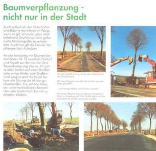
Figures 91: Luxembourg has transplanted 1,000 trees in recent years with a long-term success rate of 99%. One of the examples presented in the brochure "Straße und Umwelt in Luxemburg" (roads and the environment in Luxembourg) shows a road-widening scheme in which one row of trees is transplanted.

the same site. In Sweden, when the road between Kyrkheddinge and Hemmeslöv was widened in 1919 the decision was taken to transplant the roadside trees.