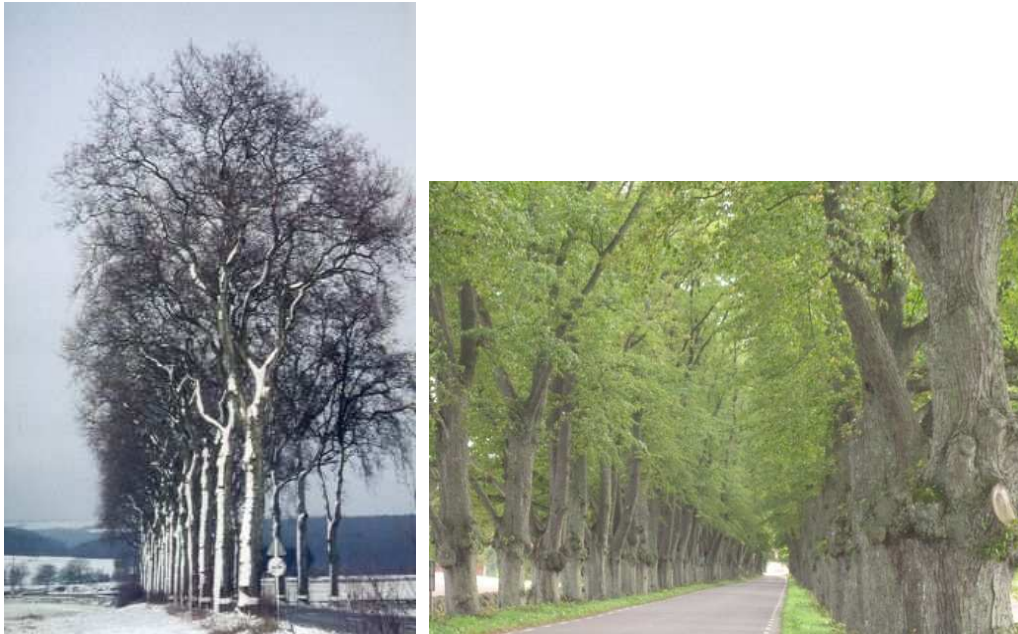
Figure 50: A very old, majestic avenue of plane trees in Luxembourg. Figure 51: The iconic allée at Övedskloster in Sweden. In 1776 Count Hans Ramel imported 4,000 lime trees to plant the roads of his estate.

In fact the road and the rows of trees accompanying it constitute an architectural feature, with a beginning and end, height, width, rhythm, proportions, and an arrangement that is a square or a quincunx. It is a living form of architecture, with the advantage over traditional architecture that it improves over time. Furthermore, the arch formed when the upper branches meet above the road is often described as a “green tunnel” or “archway”; the term “cathedral” is used in this connection as early as 1794. This description is all the more apt because the succession of trunks is naturally reminiscent of a colonnade and where the trees are planted in double rows the classically recommended proportions are the same as those for naves and side aisles. This kind of feature is architectural not only for its shape but also for the way light falls through it, creating a very distinctive ambience which changes with the passing hours and seasons.