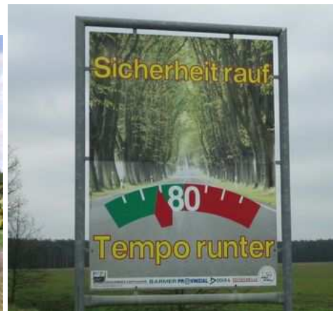
Figures 80 and 81: Contrasting perceptions of road safety and aesthetics: in France, a sign tells drivers to beware of the trees; in Germany, an image highlighting the beauty of the preserved tree avenue invites drivers to opt for safety and decrease their speed.

Conserving tree-lined roads calls for us to rethink road safety programmes in order to aim for individual prudence and responsibility. It means moving from "forgiving roadsides" – which absolve drivers of responsibility – to a concept of "calm driving".