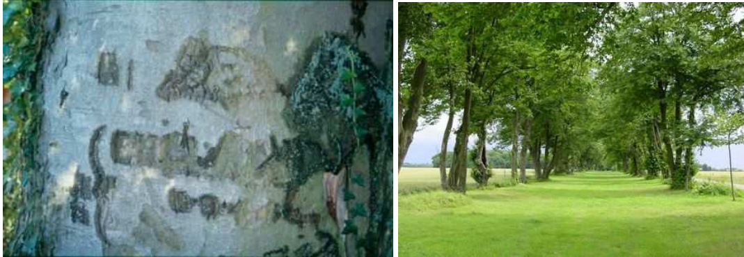
Figure 64: The beeches of Château de Bertangles (France) bear blurred inscriptions, traces of passing German soldiers in 1941. Figure 65: The avenue of lime trees at Villers-aux-Erables (France) is all that remains of the first château built here in 1680; the château was subsequently rebuilt and then completely destroyed in the First World War.

expressive one. The idea also surfaces in the proposal made by the English writer A.D. Gillespie, who was an officer in the First World War, that an avenue of trees should be planted connecting the Vosges region to the sea, to commemorate the horrors of the Great War. The idea was warmly received in the press but was not carried out.