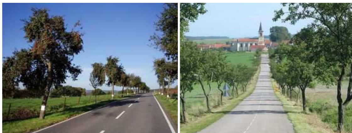
Figure 43: Fruit tree planting was substantially expanded in Luxembourg in the 1870s. One of the aims was to combat alcoholism by producing cider. Figure 44: Rows of mirabelle plum trees, traditionally identified with the Lorraine region of France.

In the second half of the 18 th century, Empress Maria Theresa of Austria encouraged the planting of avenues of fruit trees in order to boost fiscal revenues, because cider served in public was taxed. In eastern France in the 19 th century the Conseil Général of Haute-Marne ordered that all non-fruit trees should be cut down and that cider apple trees should be planted. Even though they represented 50% of trees planted in the region in 1920, they have virtually disappeared today, unlike the avenue of apple trees at Asknäs in Sweden, which was planted in 1887 and still standing in 1997.