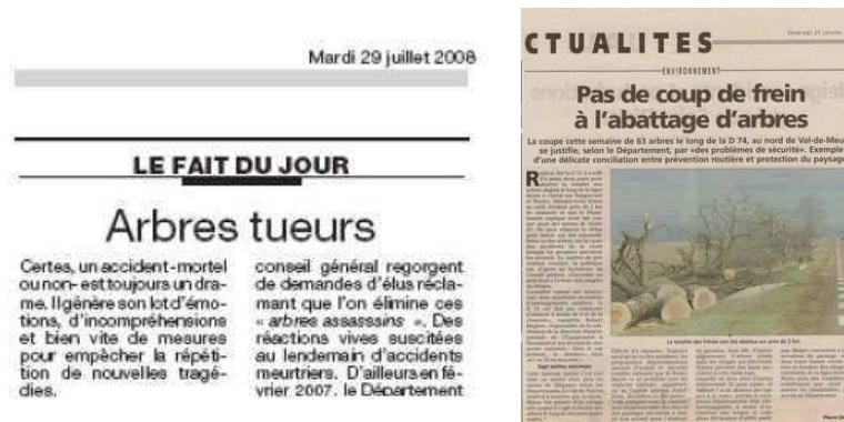
Figure 16: Trees are still accused of being the cause of deaths on the roads and whole rows of them are being cut down, as evidenced by the titles of these recent newspaper articles: "The killing trees" and "No brake on tree felling".

In the 1960s, Italian writer Gianni Roghi protested against the destruction of 260,000 trees lining Italy's roads over a five-year period, "on the pretext that they would be dangerous for drivers" (Roghi, 1964). In France, in 1970, President Georges Pompidou protested against a ministerial circular because "felling roadside trees will become the norm, under the pretext of safety." His protest apparently went unheeded: as recently as 2008 the Conseil Général of Mayenne was subsidising the felling of roadside trees. 4