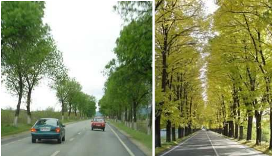
Figures 33 and 34: Tree-lined roads in Romania and Italy.

Although tree-lined roads have existed far beyond the European arena, their rapid dissemination across the western world is closely linked with the influence of the French style of gardening: this is reflected in the use of the terms “allée” and “avenue” in many countries, terms which are also used for tree-lined roads in the open countryside. Having founded the École des Ponts et Chaussées in 1747, France exported both its expertise in road construction and its engineers’ taste for regular planting schemes, and this also played an important role.