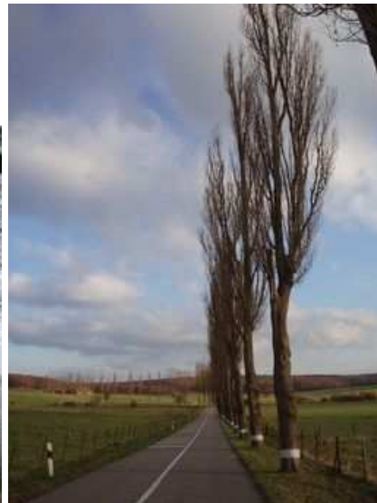
Figures 39 and 40: Double row of Swedish whitebeams, fashionable in the south of the country in the early 20 th century, and Lombardy poplars in Luxembourg.

The resources available to the planters and the availability of the trees also explain the differences between some types of plantation. This can still be clearly seen in Sweden today, where rows of trees along country roads were traditionally planted by local farmers, who generally used a mixture of different species found in the nearby forest. Meanwhile, from the 17 th century, wealthy landlords were able to import lime trees from Holland or Germany to create uniform avenues more consistent with the canons of formal beauty.