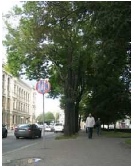
Figure 18: Riga, a “green city”, with a large number of trees which requires constant vigilance, as in forest regions.

during real-estate or infrastructure projects and totally neglected while the works are under way, resulting in unnecessary loss through felling or tree death.