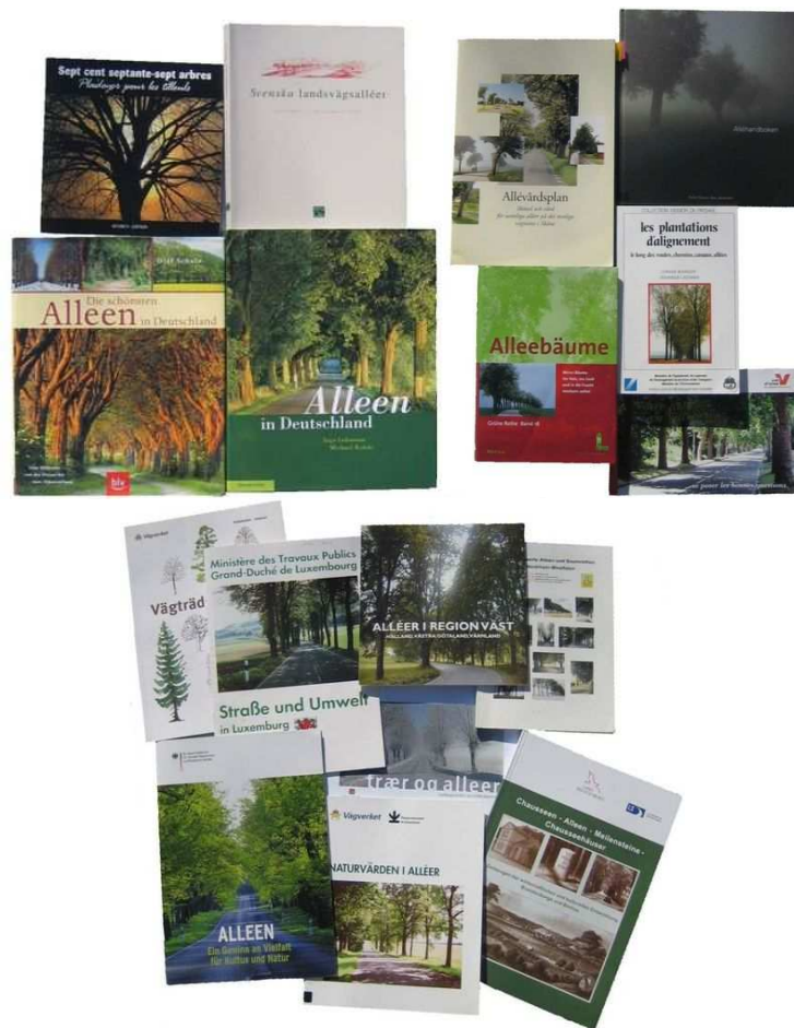
Figure 111: Research and consciousness-raising work is already under way in some countries. For more information please see the appended Bibliography.

Latvia, 2007, with presentations from France and Germany; Pisz, Poland, 2008, with presentations from Germany; Cernier, Switzerland, 2008, again with presentations from Germany).