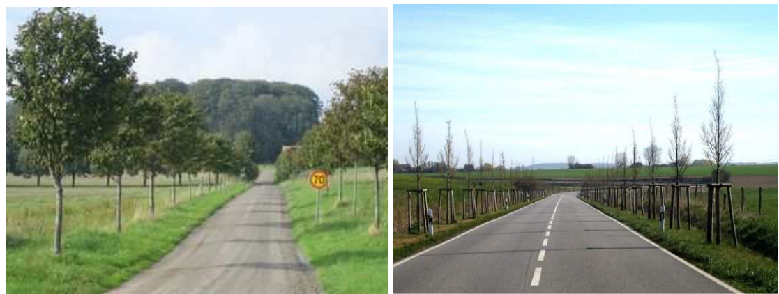
Figure 98: A young plantation in Sweden. Figure 99: This new plantation, extending over nearly 3 kilometres, is made up of hornbeams planted close together and close to the road, already creating a visible 'avenue' effect. The German state of Mecklenburg has lined 1,750 km of roads in this way since 1990.