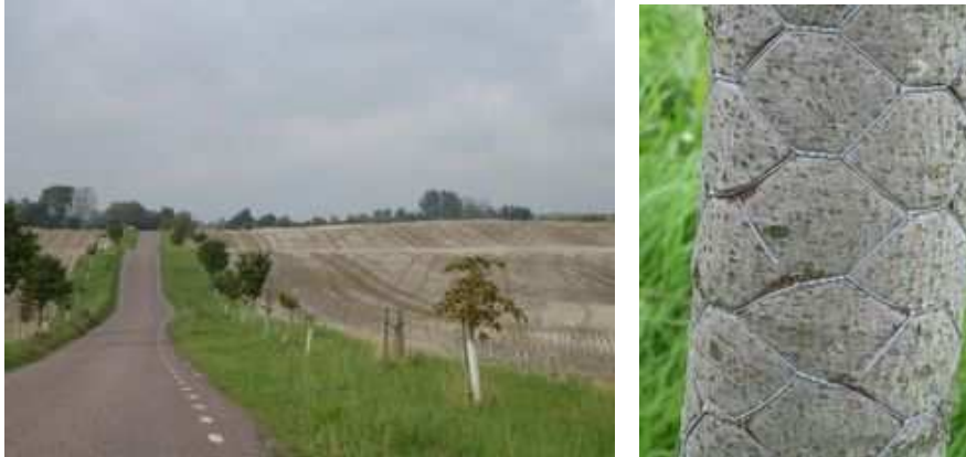
Figures 30 and 31: Poor quality plants, poor planting conditions and lack of aftercare impede the creation of high-quality tree-lined roads.

In addition to these factors relating to tree management and the trees' environment, other external factors also play a contributory role in weakening our heritage: diseases, pests, climate change, etc.