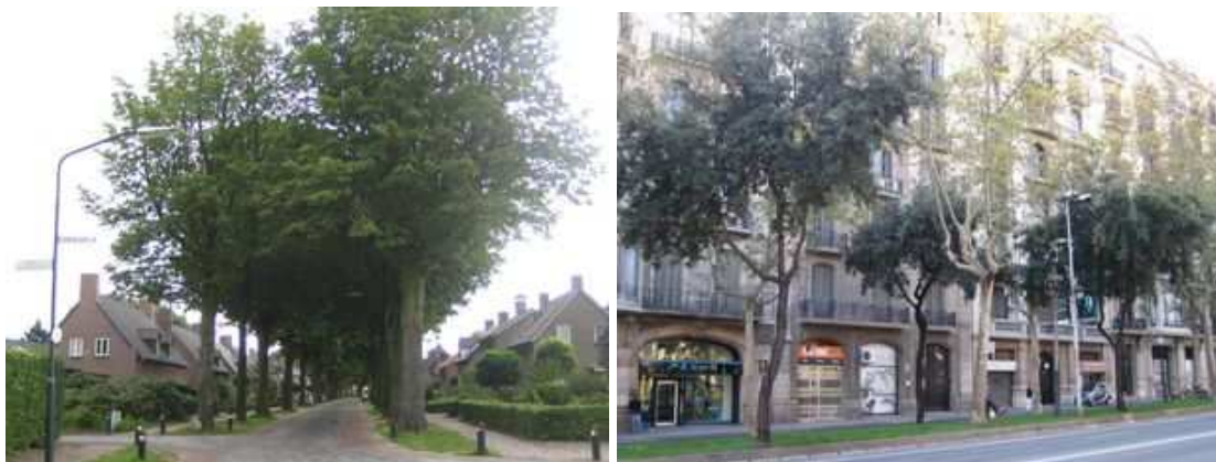
Figure 48: An arrangement in the spirit of the Dutch “Sustainable Safety” programme: trees are used to keep pedestrian walkways separate from cars. Figure 49: A double row on a central reservation in Barcelona.