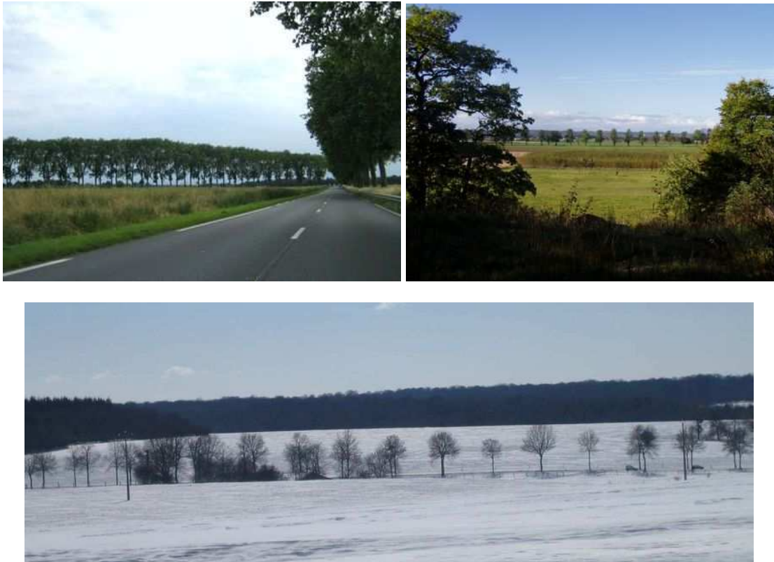
Figures 45, 46 and 47: A distinctive presence in French and Swedish landscapes.

In other words tree-lined roads structure the space of a landscape. This is true of the countryside, but it is particularly evident in towns, where the volumes created vary according to the shape of the trees selected and the way they are arranged – in the middle of the roadway or to the sides, for example.