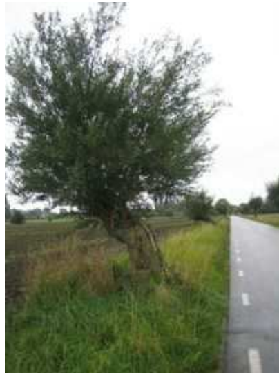
Figure 8: Sweden's willows supplied firewood, fodder, and wood for fences

For Chaumont de la Millière, responsible for the administration of French roads between 1781 and 1792, tree planting along roadways was vital because the scarcity of wood was “beginning to cause concern which is all too well founded” (Reverdy, 1997). By 1789, the shortage of firewood was beginning to make itself felt, its price having more than doubled in 20 years.