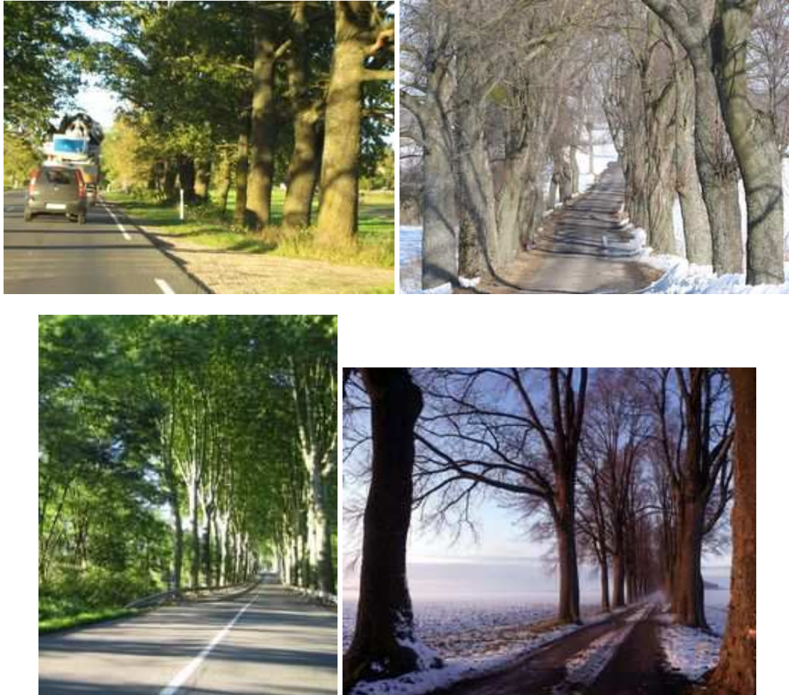
Figures 54, 55, 56 and 57: Light effects in Latvia, Poland, France and Sweden.

Tree-lined roads also give shape to the landscape, creating sometimes a rhythmic effect, sometimes a unity. Travellers along a road lined with trees see the landscape as a dynamic succession of images framed by the tree-trunks, which function as “windows” (another architectural term). The landscape is neither closed off (as it is by unbroken hedgerows) nor so wide open that the gaze gets lost in it: the space is framed and displayed to best effect.