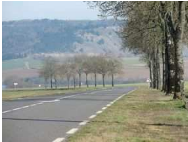
Figure 13: In 1895, 87% of roads in the French département of Meuse were lined with trees on both sides: a total of 44,000 trees. Now just fragments of this heritage remain, comprising less than 7,000 trees in all.

of the most aware of its heritage, now has less than one tenth (17,500) of the number of trees planted along its roads in the late 19 th century (200,000).