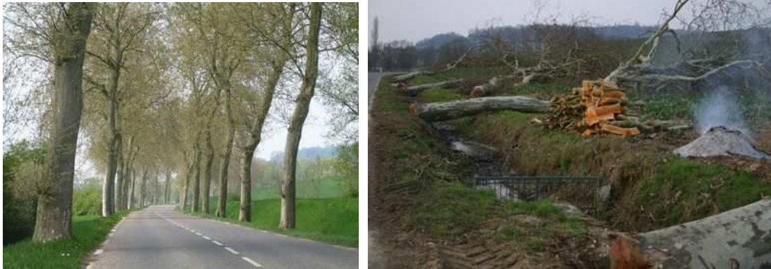
Figures 68 and 69: The ditch exposed after cutting down this double row of plane trees is not designed to mitigate accidents. In France, ditches, along with embankments and rock faces, constitute the solid obstacle accounting for the largest number of serious injuries and the second largest number of road deaths.

A compromise is sometimes proposed, which involves combining tree-felling with replanting beyond the so-called “safety” zone. Whatever the distance involved, whether it is 4m, 7m, or more than 10m, the facts show that unfortunately run-off-the-road accidents are frequently fatal because of factors which may already have taken effect before the impact (vehicle rollover, fatal heart attack, etc.). The idea of planting beyond the ditch does not make any difference: except on a small number of major roads, none of these ditches are designed to mitigate the effect of run-off-the-road accidents. Nor does erecting crash barriers solve the problem: installing them is impossible given the proximity of the trees to the road in most cases, and trees either side of driveway junctions would have to be cut down. Moreover barriers are unattractive and obstruct roadside maintenance, while they too constitute a roadside obstacle which takes its own toll of crash victims every year.