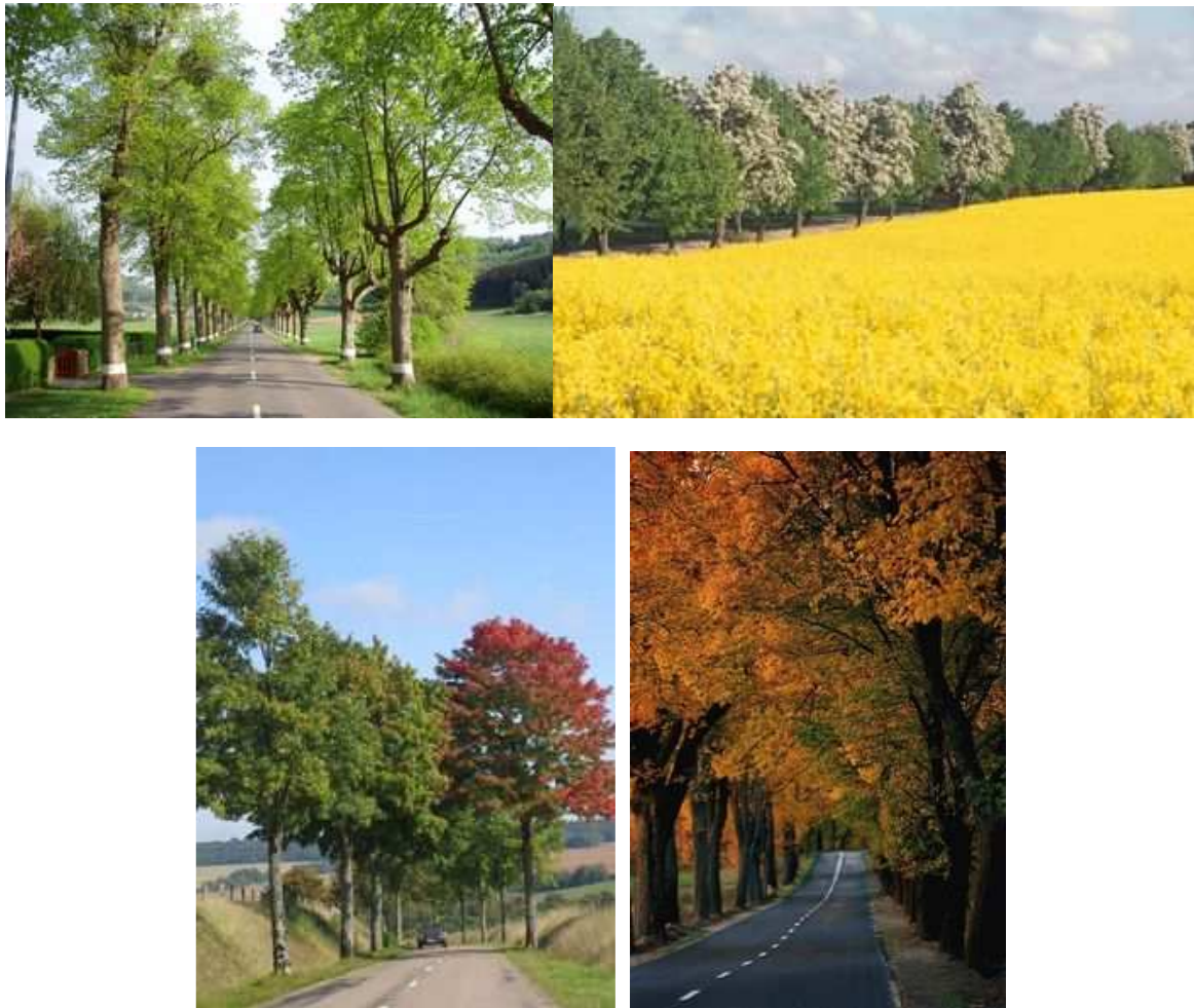
Figures 9, 10, 11 and 12: The beauty of the spring landscape in Luxembourg and Sweden, with its mixed rows of chestnut and pear trees, is every bit as striking as the fiery autumn colours of tree-lined roads in France and Poland.

To say that the rows of trees planted along country roads fulfilled not just practical purposes but also a deep-seated aesthetic impulse, just like Baroque allées and urban boulevards, is neither a misreading nor a merely modern interpretation.