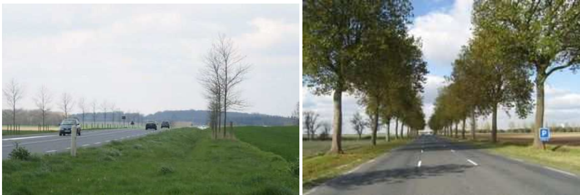
Figures 21 and 22: Even when the local authority decides to bear the additional costs involved in land acquisition, excessive planting distances make it impossible to re-create the “cathedral” effect produced when the proximity of the road and the trees creates a distinctive and integrated space.

This planting shortfall is critical given the natural ageing process affecting the remaining trees. The crisis is all the more severe because tree ageing and death are accelerated when the trees located alongside roads or streets are mistreated – and such mistreatment is all too evident.