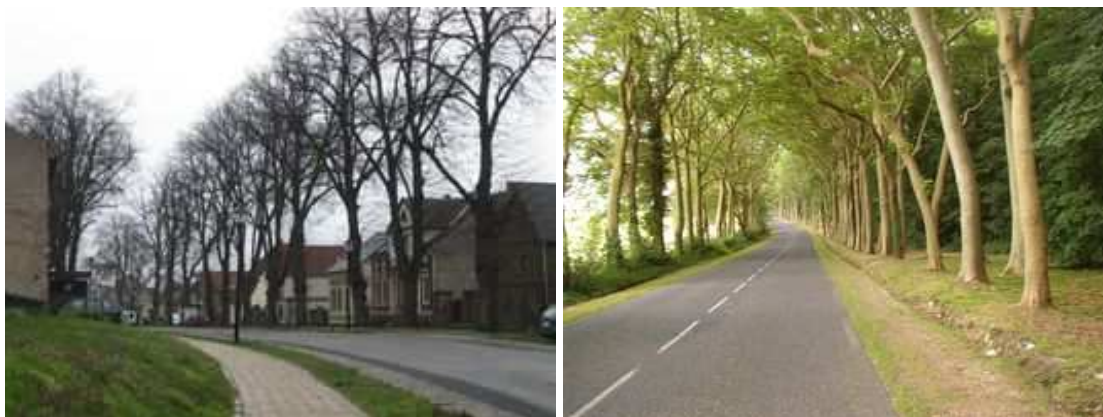
Figures 60 and 61: The landscape is unified by the row of trees. Disparate buildings merge together behind the regular screen formed by the tree-trunks; alternatively, the tree-trunks stand out against the darker backdrop of the forest, creating a distinctive mellow effect.

Rows of trees also provide a clue to reading the landscape. During the First World War, for example, tree-lined roads were a key feature in the iconography of the battlefields. On a more mundane level, the way trees are arranged and presented effectively signposts an urban environment or the approach to a built-up area: trees are more effective and attractive than other forms of signage.