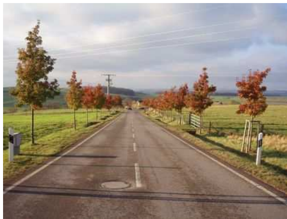
Figure 102: Young pear trees spaced at distances gradually reducing from 15m to 10m to signal the approach towards a village.

Figures 100 and 101: Where fields or other restrictions limit the space available there is only one thing to do: plant close to the road edge, particularly when the new tree is filling a gap as in the left-hand photo. In any case the rows of trees must be kept relatively close to one another in order to achieve an “arch” effect.