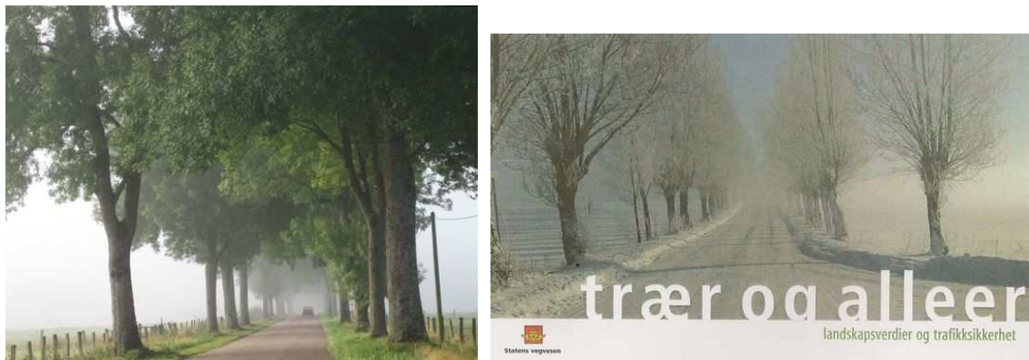
Figure 72: In fog, when there are no road markings, trees provide valuable assistance. Figure 73: Norway's roads department highlights the vital role played by tree avenues in a country with snowy winters.

The trees lining past help drivers maintain awareness of their speed without looking at their speedometer. By channelling lateral vision they also encourage prudence, whereas an open roadway reduces vigilance and encourages speed. Finally it should be noted that research has demonstrated a link between the beauty of a road and higher levels of road safety.