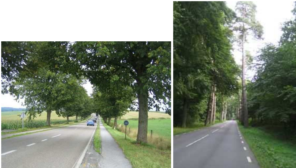
Figure 123: The 777 lime trees on the road from Neufchâteau to Bertrix, in Belgium, are not protected because they are spaced more than 10m apart. Figure 124: This remnant of a pine avenue in Sweden is visually very interesting because of the contrast with the colours and shapes of the surrounding forest, but it is not protected and so it is not renewed. Meanwhile just a few hundred metres away whole network of deciduous tree avenues is lovingly maintained.

The scope of the protection provided is key to assessing the effectiveness of these regulations: for example, while Wallonia, Sweden and Mecklenburg all protect both single- and double-row avenues, single rows are excluded from the protection provided in Brandenburg.