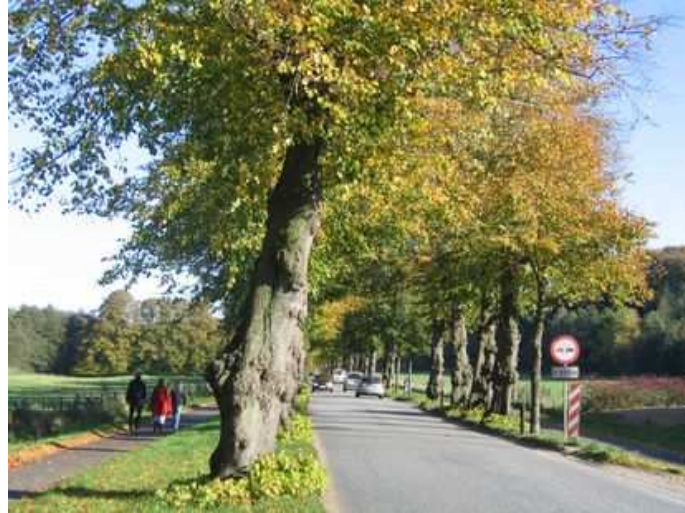
Figure 105: This double row of trees from 1830 (Rathlousdals Allé in Denmark) borders a roadway that is 5.1m wide, with traffic levels of 5,000 veh/day. It has been protected since 1979, and this is supplemented by a prohibition on winter salting, as is also the case in Freiburg in Germany. Elsewhere in Denmark screens are used to protect trees from the salt.