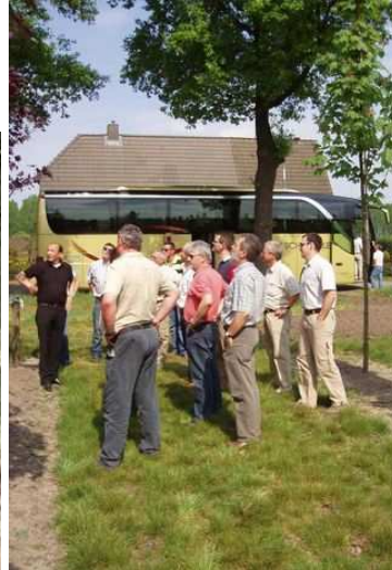
Figure 112: In Sweden, training courses covering historic, biological and technical issues have been provided since 1996 for private landowners, many of them farmers, and for the roads department, which invites businesses to take part. Figure 113: Nursery tour organised for road specialists and public officials in Luxembourg.