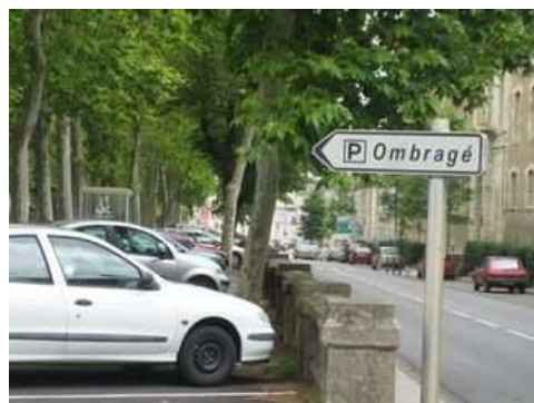
Figure 66: The cooling effect of trees is estimated at 4°C to 10°C in a heat wave while some studies report an energy saving of 10% in the surrounding habitat. The sign in the photograph says "Shade".

With climate change and the decline of fossil fuels, trees' role in providing shelter from wind and sun is bound to attract increased interest. The process of evapotranspiration effectively makes them atmospheric air-conditioners, limiting the impact of extreme temperatures, while the Venturi effect operating between the ground and the tree's crown prevents snow drifts building up in the winter. Furthermore, roadside trees help reduce peak run-off flows, a vital factor; this also counters erosion and reduces the risk of landslides.